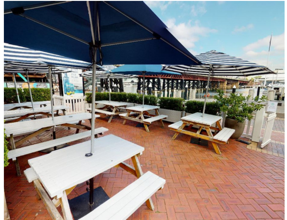
CBYC Alfresco area

In addition to the impressive setting, we deliver an exceptional standard of service throughout the event process. Meet our experienced team of staff & management, whose job is to ensure that you have the best experience possible. We pride ourselves on being able to tailor packages to suit individual needs & desires, we know that no two parties are ever the same!