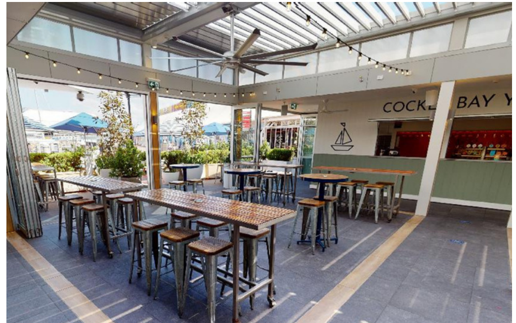
CBYC Reception Seating